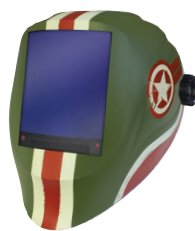
TANK Order no. BFFVX-1555