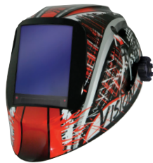
SPEEDWAY Order no. BFFVX-1523