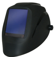
BLACK Order no. BFFVX-1500