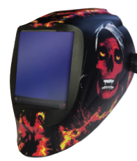
EL DIABLO Order no. BFFVX-1579