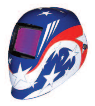
Variable Shade Filters