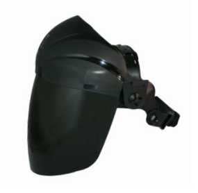
BG2 Shown with 2DGN