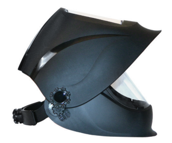
AIRSHIELD® WITH VISION®