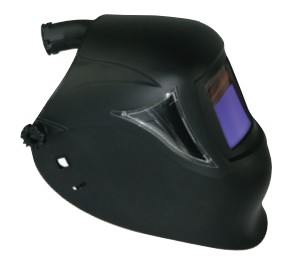
EAGLE® WITH AIRPLUS®