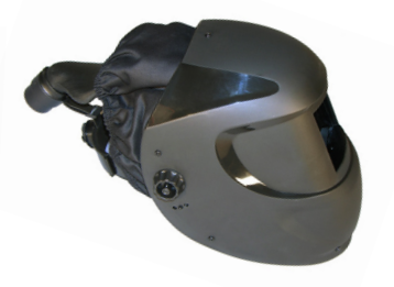
VISION® WITH AIRPLUS®